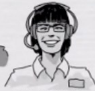
AIR TRAFFIC CONTROLLERS